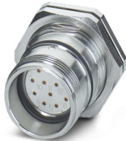
M23, Device connector rear mounting, series: RC, straight, shielded: yes, Screw locking mechanism, Axial O-ring, Panel thickness min.: 0.8 mm, Panel thickness max.: 6.5 mm

Please be informed that the data shown in this PDF document is generated from our online catalog. Please find the complete data in the user documentation. Our general terms of use for downloads are valid.