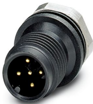
Sensor/actuator flush-type connector, male connector, 5-pos., M12, A-coded, front/screw mounting with M12 thread, with solder cups, plastic version

Please be informed that the data shown in this PDF document is generated from our online catalog. Please find the complete data in the user documentation. Our general terms of use for downloads are valid.