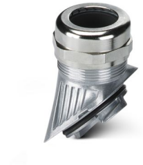
EVO metal cable gland with bayonet locking; size M40, with filler plug

Please be informed that the data shown in this PDF document is generated from our online catalog. Please find the complete data in the user documentation. Our general terms of use for downloads are valid.