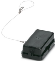
Protective cover B10, for single locking latch, protective cover material: PA, height: 18.5 mm, seal: no

Please be informed that the data shown in this PDF document is generated from our online catalog. Please find the complete data in the user documentation. Our general terms of use for downloads are valid.