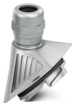
EVO metal cable gland with bayonet locking, B series, size M20, cable diameter: 7 - 13 mm

Please be informed that the data shown in this PDF document is generated from our online catalog. Please find the complete data in the user documentation. Our general terms of use for downloads are valid.