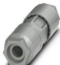
QUICKON cable connector, gray, 4+PE-pos., 2.5 mm 2 ... 6.0 mm 2 /690 V/40 A, for cable diameter of 12 mm ... 20 mm.

Please be informed that the data shown in this PDF document is generated from our online catalog. Please find the complete data in the user documentation. Our general terms of use for downloads are valid.