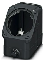
HEAVYCON EVO sleeve housing, plastic, with bayonet flange for EVO screw connection, B10, for single locking latch, height: 60.5 mm, without EVO screw connection

Please be informed that the data shown in this PDF document is generated from our online catalog. Please find the complete data in the user documentation. Our general terms of use for downloads are valid.