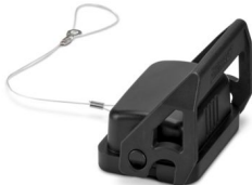
Protective cover B6, with single locking latch, protective cover material: PC, height: 26.3 mm, seal: yes

Please be informed that the data shown in this PDF document is generated from our online catalog. Please find the complete data in the user documentation. Our general terms of use for downloads are valid.