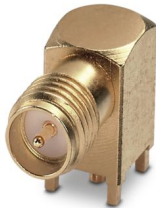
Coaxial PCB connector, degree of protection: IP20, number of positions: 1, 12 Gbps, material: Metal, connection method: Solder connection, cable outlet: straight

Please be informed that the data shown in this PDF document is generated from our online catalog. Please find the complete data in the user documentation. Our general terms of use for downloads are valid.