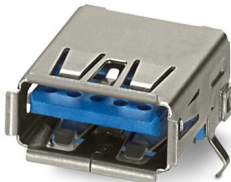
USB PCB connectors, connection direction of the connector to the PCB: 90 °, number of positions: 9, 5 GBit/s, Wave soldering

Please be informed that the data shown in this PDF document is generated from our online catalog. Please find the complete data in the user documentation. Our general terms of use for downloads are valid.