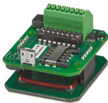
CHARX control modular, RFID device, for connection to CHARX control modular AC charging controllers

Please be informed that the data shown in this PDF document is generated from our online catalog. Please find the complete data in the user documentation. Our general terms of use for downloads are valid.