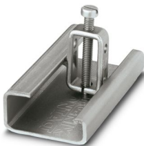
End clamp, width: 8 mm

Please be informed that the data shown in this PDF document is generated from our online catalog. Please find the complete data in the user documentation. Our general terms of use for downloads are valid.