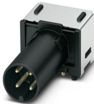
Contact carrier, 4-position, Pin, angled, M12, A-coding, THR solder connection

Please be informed that the data shown in this PDF document is generated from our online catalog. Please find the complete data in the user documentation. Our general terms of use for downloads are valid.