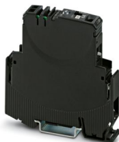
Electronic circuit breaker, 1 reset input, nominal current: 6 A

Please be informed that the data shown in this PDF document is generated from our online catalog. Please find the complete data in the user documentation. Our general terms of use for downloads are valid.