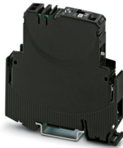
Electronic circuit breaker, signal contact: 1 N/O contact, nominal current: 4 A

Please be informed that the data shown in this PDF document is generated from our online catalog. Please find the complete data in the user documentation. Our general terms of use for downloads are valid.