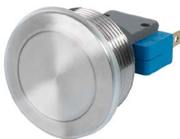
MSM switch is not part of the product