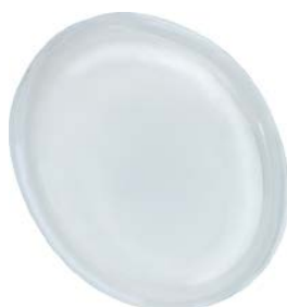
Protection cover for MSM 19 and MSM 22