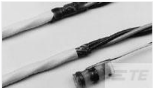
TE Part #696901-000 B-900-03