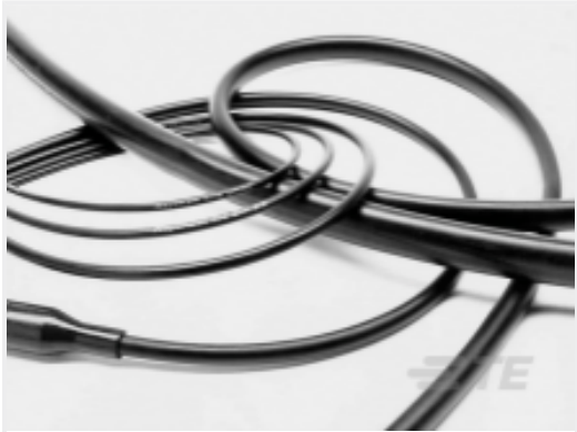
TE Part #CAT-R21-T7907 Single Wall DR 25: Heat Shrink Tubing, 2:1 Shrink Ratio