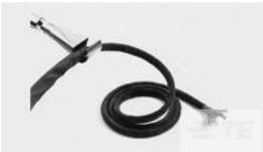
TE Part #CB03464001 RW-200-E-2-0-SP