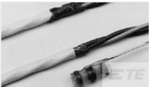
TE Part #696489-000 B-900-02