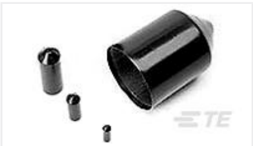
TE Part #843191-000 101A083-4-0