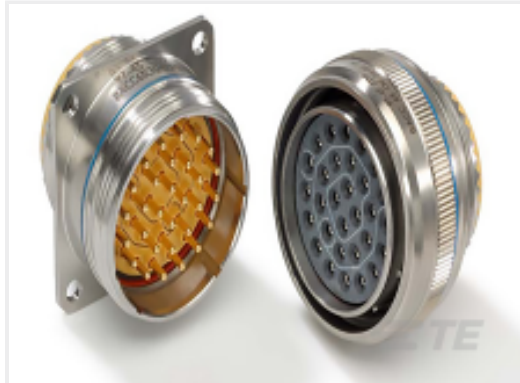
TE Part #ZPF000000000034478 983-0YE 18-14 PN