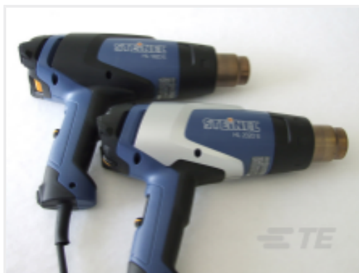
TE Part # EG8162-000 HL1920E-230V-EURO