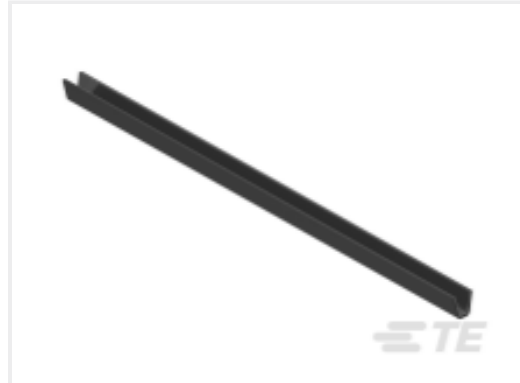
TE Part #5039822001 TPEN-NR6-0-STK