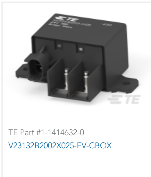
TE Part #1-1414632-0 V23132B2002X025-EV-CBOX