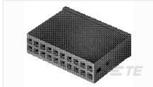
TE Part #1-926209-0 2X10P LOCK-CLIP GEH