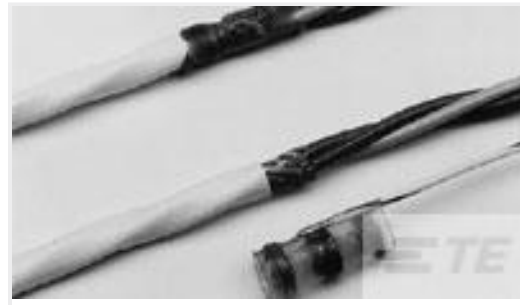
TE Part #481803-000 CWT-3807