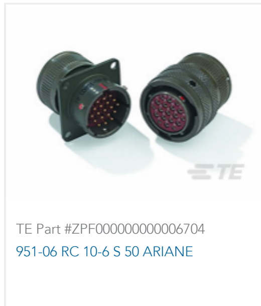
TE Part #ZPF00000000006704 951-06 RC 10-6 S 50 ARIANE