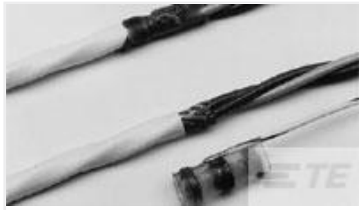
TE Part #031307-000 B-150-13