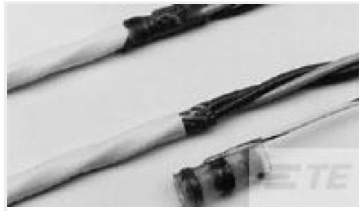
TE Part #042313-000 B-150-23