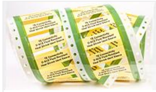
TE Part #7243890001 D-SCE-5K-3.2-50-4