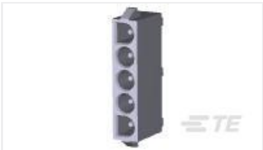
TE Part #640466-1 05P UMNL PIN HDR ASSY V2 NATL