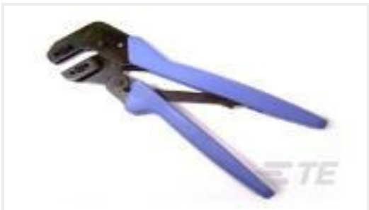
TE Part #91337-1 SIZE 16 PRO-CRIMPER ASSY.