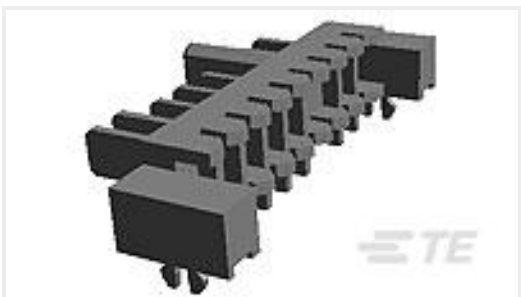
TE Part #6318790-1 PLUG ASSY,PB-FREE,2.5 SLIM BATTERY OFF-S