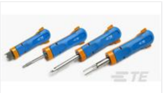
TE Part #1-1579007-1 EXTRACTION TOOL