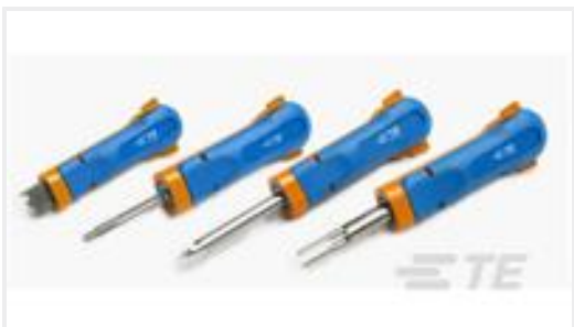
TE Part #2-1579007-1 EXTRACTION TOOL