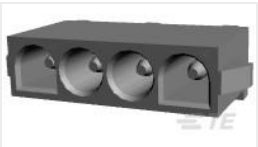
TE Part #350430-1 04P UMNL PIN HDR ASSY NATL