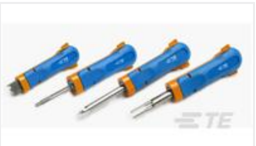
TE Part #539960-1 AUSZ-WKZ,MICRO TIM.