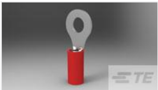
TE Part #31894 PIDG R 22-16 COMM 22-18MIL 1/4