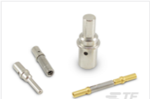
TE Part #CAT-D48-ST273 DEUTSCH Solid Contacts