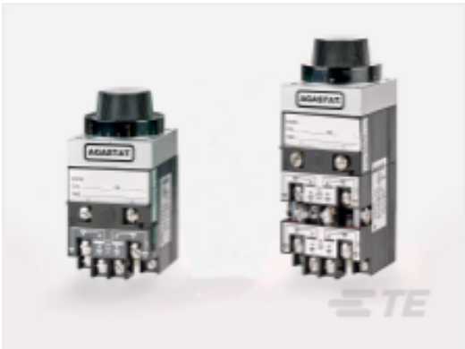
TE Part # 2-1423157-4 7012AK=RLY,STD,ON,2P,120VAC,30

as defined in the Annexes of Directive 2000/53/EC (ELV). Regarding the REACH Regulations, TE’s information on SVHC in articles for this part number is still based on the European Chemical Agency (ECHA) ‘Guidance on requirements for substances in articles’(Version: 2, April 2011), applying the 0.1% weight on weight concentration threshold at the finished product level. TE is aware of the European Court of Justice ruling of September 10th, 2015 also known as O5A (Once An Article Always An Article) stating that, in case of ‘complex object’, the threshold for a SVHC must be applied to both the product as a whole and simultaneously to each of the articles forming part of its composition. TE has evaluated this ruling based on the new ECHA “Guidance on requirements for substances in articles” (June 2017, version 4.0) and will be updating its statements accordingly.