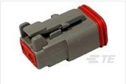
TE Part #DT06-2S PLG, 2P, GRY, N