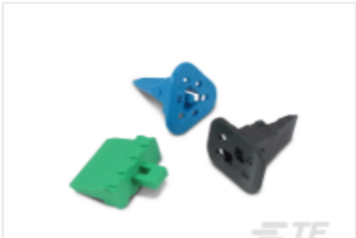
TE Part #CAT-D487-W416 Wedgelocks: DEUTSCH DT