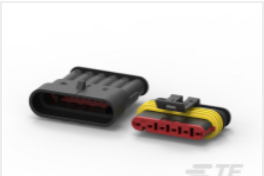
TE Part #CAT-AM71-CH8172 AMP SUPERSEAL 1.5MM, CONNECTOR HOUSING