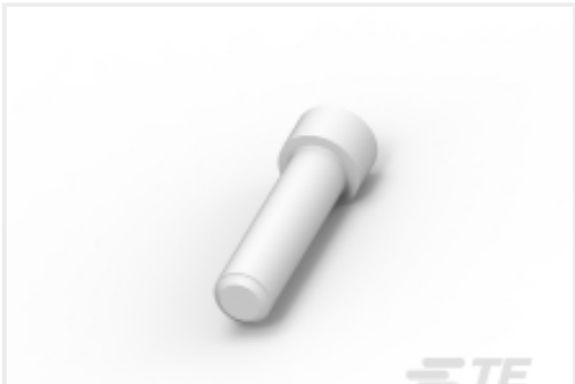
TE Part #114017-ZZ SEALING PLUG, SIZE 12/16, WHT