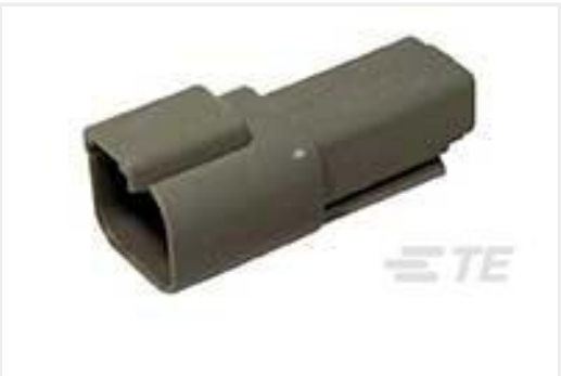
TE Part #DT04-2P REC, 2P, GRY, N