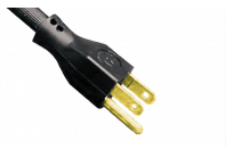
5-15P Straight Blade