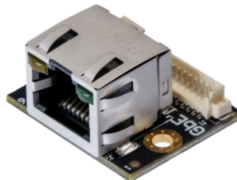
BE323 RJ45 adapter