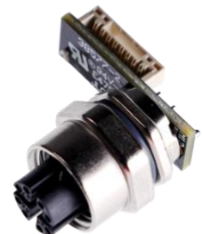
BS441 M12 X-Code adapter