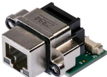
BE322 IP67 RJ45 adapter

*requires a pico blade to JST-GH adapter