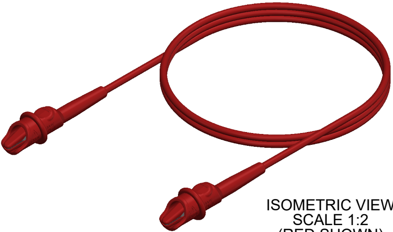
ISOMETRIC VIEW SCALE 1:2 (RED SHOWN)

MODEL NUMBER CT4484-L- # COLOR: 0 - BLACK 2 - RED LENGTH: (cm)