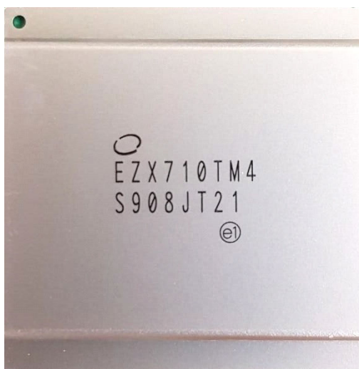
Figure 1-1. Example Component with Identifying Marks