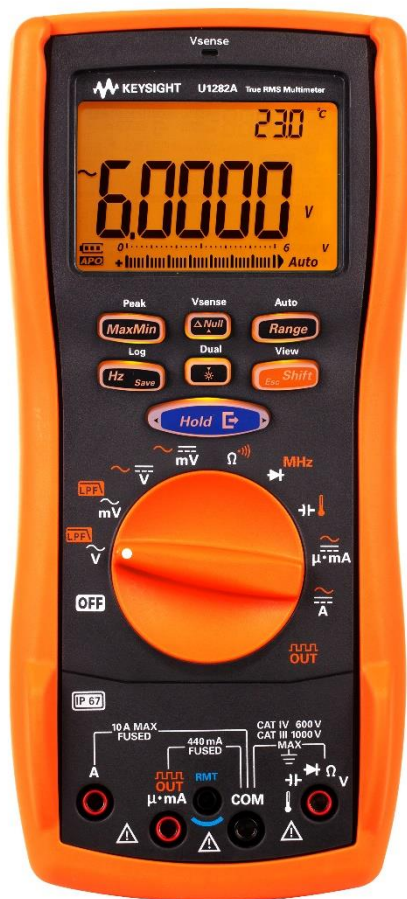
Figure 1. Large display and backlit keypad allow users to complete their jobs even in subdued lighting conditions.

Troubleshooting in most electrical environment is typically dangerous due to the high voltages involved. Now with the unique built in Vsense feature, you get a quick sense of AC voltage presence without the need to probe. When voltage presence is detected, it produces a unique combination of audible beeper alert and blinking LED light to alert users. This is especially useful to safeguard users from exposure to live wires, suspected AC voltage presence or simply an act of safety precaution before initiating a task. Work with a peace of mind knowing your safety comes first with Keysight's U1280 Series handheld DMM .