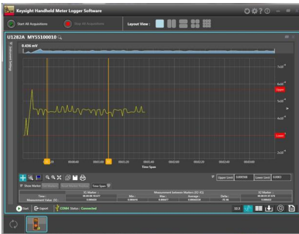
Figure 2. U1282A data log trend plot with markers and limit levels.

When it comes to the need to observe measurements over a period of time, Keysight Meter Logger software provides a comprehensive data logging experience with Keysight U1280 Series as well as other Keysight U1200 Series handheld DMMs. The handheld DMM can be easily connected to the Meter Logger software that runs on a PC via Infrared (IR)-to-USB cable. Keysight Meter Logger software provides users the flexibility and useful configuration to log their measurements, such as the flexibility to select sample interval, enable limit levels on the data log and email notification option for when the limit is exceeded. The data log measurements can be presented either by trend plot or table format for easy interpretation and further analysis — essential for troubleshooting and commissioning tasks. Once the measurements are recorded in the software, users can transfer the logged data into various types of report formats with just a click of the button.