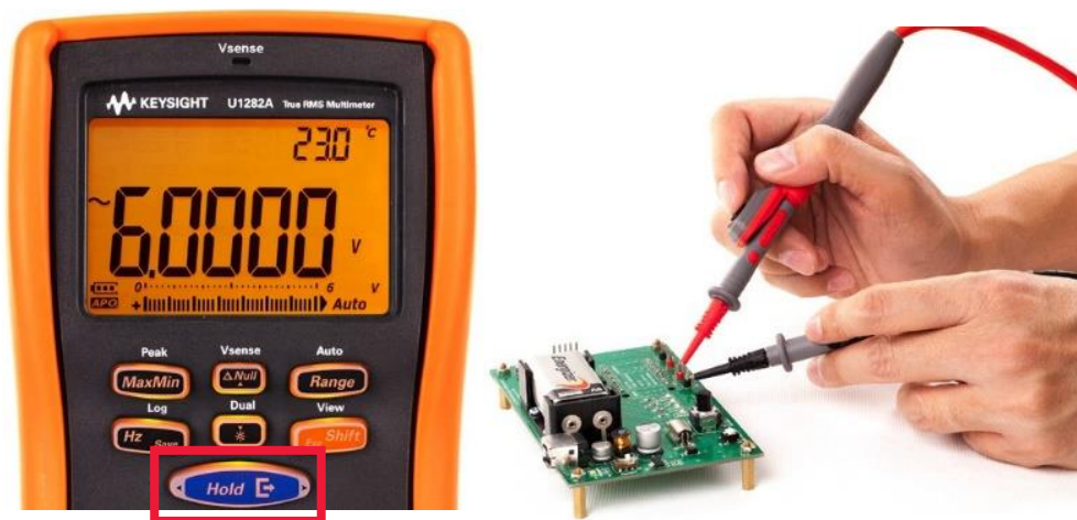
Figure 5. Hold & Export button — one press for three actions: Measure, save it into handheld DMM's memory and send the measurement out via infrared port. Optional U5404A remote switch probe emulates 'Hold & Export' button.

While data logging over a period of time is useful to capture measurements for further observations and analysis, manual data log is just as useful to conveniently record measurements and reduce human error occurrence from conventional manual data entering process. Better yet, users are able to store measurement readings into the handheld DMM's internal memory and at the same time export the measurements to the Keysight Meter Logger software via the DMM's infrared port — all of these by simply pressing the 'Hold & Export' button. When the situation requires users to concentrate on probing, the optional U5404A remote switch probe can be used to perform manual logging by emulating the 'Hold & Export' button of the U1280 Series handheld DMMs.