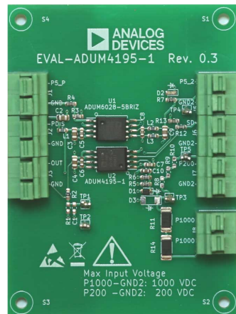
Figure 1. EVAL-ADuM4195-1EBZ