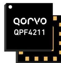
16 Pad 2.5 x 2.5 mm Laminate Package