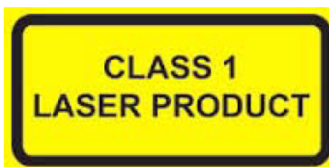
Figure 3. Class 1 laser product label

The VL53L1 contains a laser emitter and corresponding drive circuitry. The laser output is designed to remain within Class 1 laser safety limits under all reasonably foreseeable conditions, including single faults, in compliance with IEC 60825-1:2014 edition 3. The laser output remains within Class 1 limits as long as STMicroelectronics' recommended device settings are used and the operating conditions specified in the datasheet are respected. The laser output power must not be increased by any means and no optics should be used with the intention of focusing the laser beam.