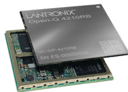
Open-Q 4210 SIP