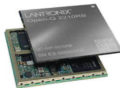
Open-Q 2210 SIP