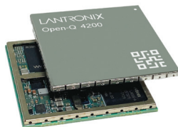
Open-Q 4200 SIP Family