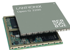
Open-Q 2200 SIP Family