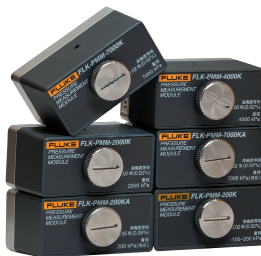
Figure 1. Rechargeable lithium battery with capacity indication.

HART communication enables mA output trim, trimmed to applied values, and pressure zero trimming of HART pressure transmitters. You can easily change a transmitter tag, measurement units and ranges. Other supported HART commands include setting fixed mA outputs for troubleshooting, reading device configuration parameters and reading device diagnostics.