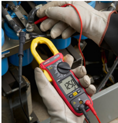
AMP-320 AC/DC Clamp Meter Electrical Motor Maintenance