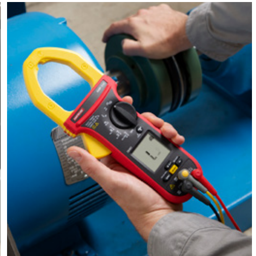
AMP-330 AC/DC 1000 A Clamp Meter Industrial Motor Maintenance