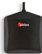
49.1 x 46.1 x 15.9 mm