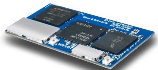
Open-Q 626 μSOM