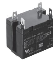
Plug-In Type Shown