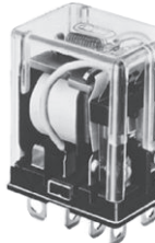
Plug-In Type Shown