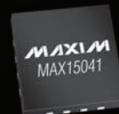
PWM Step-Down DC-DC Regulator Page 374