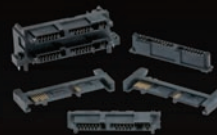
Micro SAS Receptacles Pg. 1228

Stay connected. Find What's Next, right now at Mouser. To learn more, visit mouser.com/molex